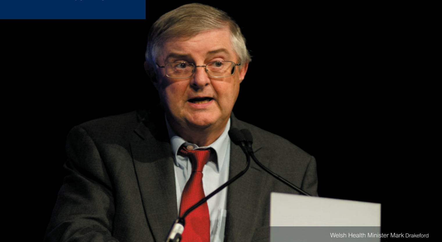
Welsh Health Minister Mark Drakeford